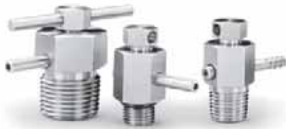
BV Series Bleed Valves